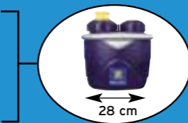
Treatment unit: compact and easy to install in an existing installation.