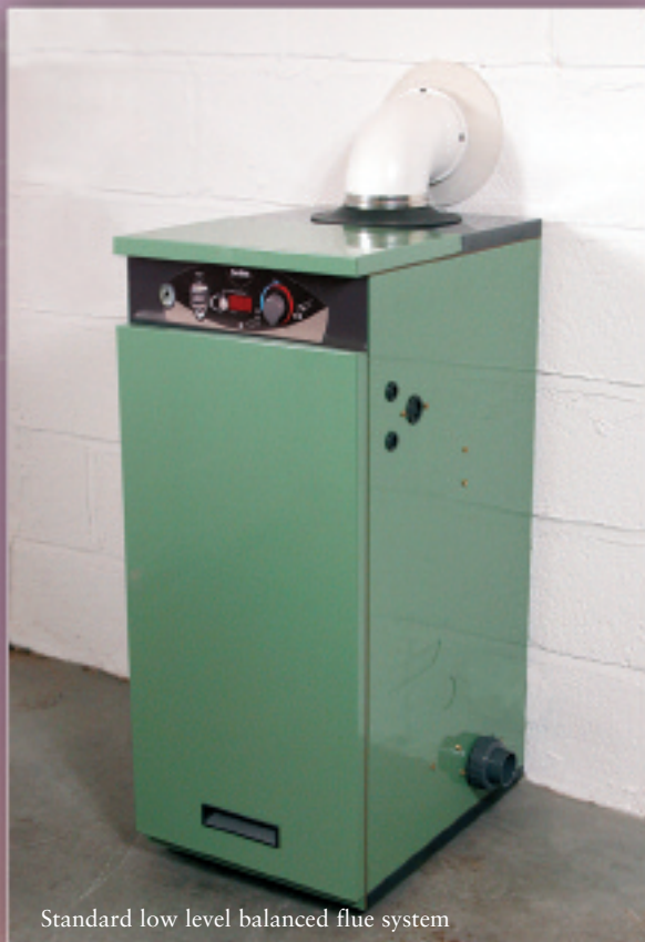
Standard low level balanced flue system